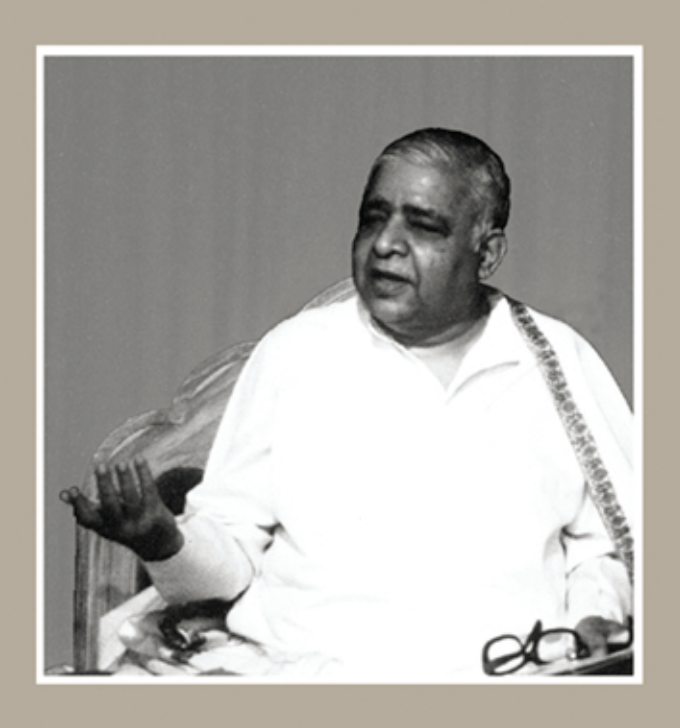
"The tenth day is over. . ."